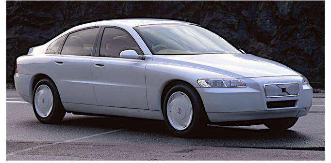
Volvo's Environmental Concept Car (ECC)