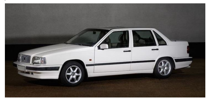
Volvo 850 turbine-electric

Yes, Volvo, noted builder of solid, safe and not particularly exciting cars (well, there were the P1800, 1800ES and C-30). At one point, Volvo installed gas turbines in a couple of vehicles developed from the 260 and 780. The company topped the effort in 1991, when it turned two 850s fitted as hybrids, featuring a combined gas turbine and electrical system to power the car.